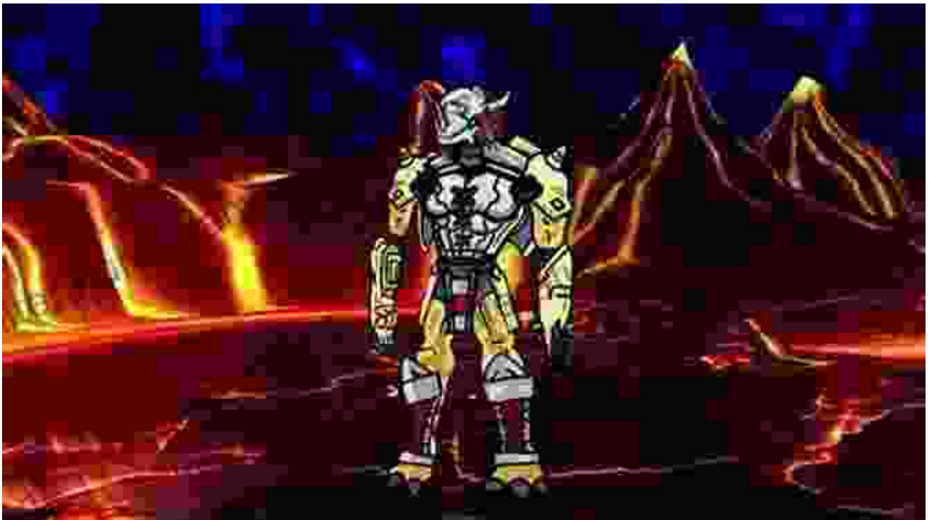
The Journey of Transformation for Sammy, Holly, and Benny